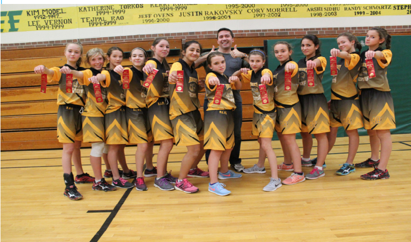
Intermediate Volleyball Girls Team Winners Area