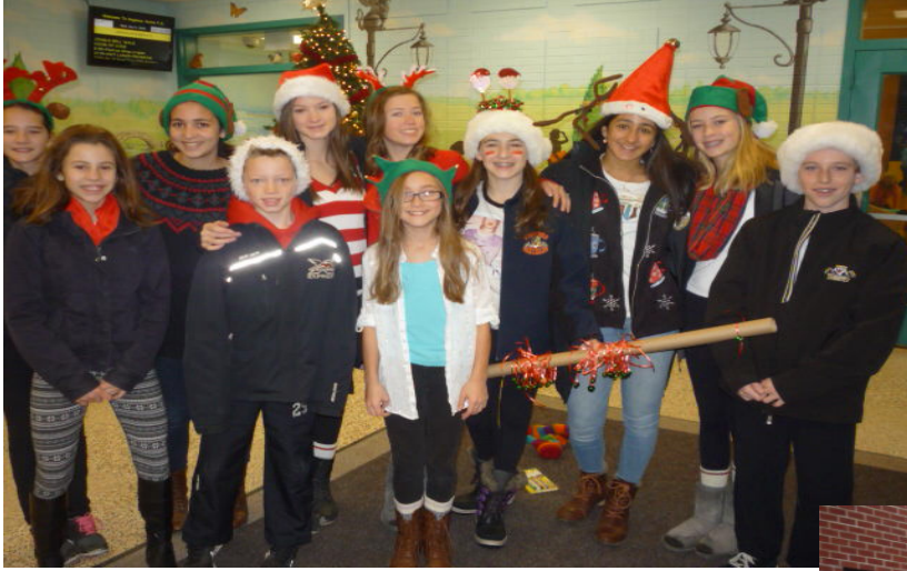
Jingle Bell Walk