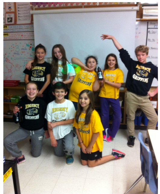
Regency Spirit Wear